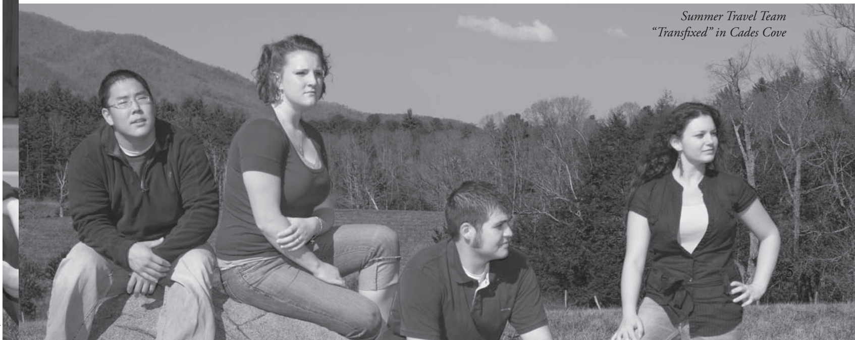
Summer Travel Team “Transfixed” in Cades Cove

Complete work on the strategic plan related to capstone courses.