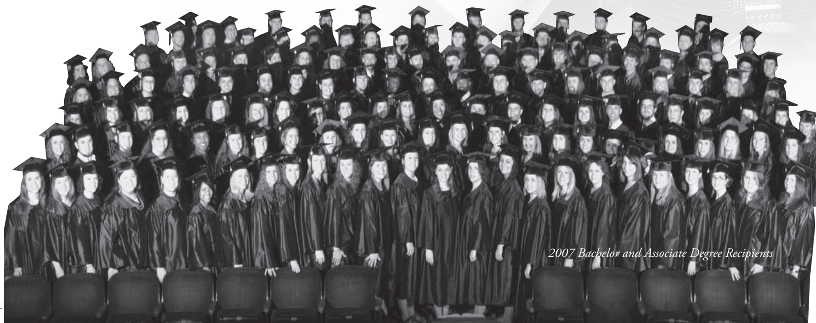
2007 Bachelor and Associate Degree Recipients

Bible Studies – 13 Missions – 5 Early Childhood Education – 2